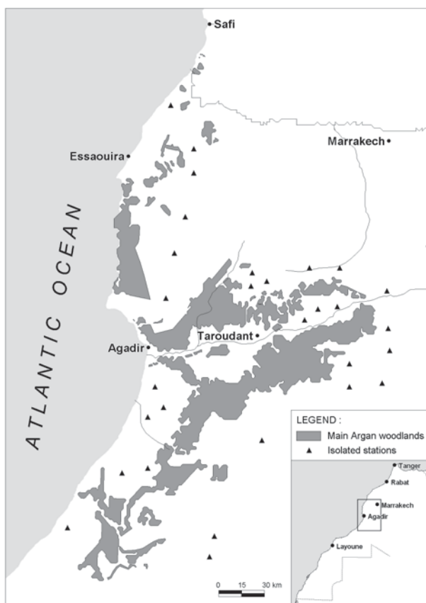
Figure 2. Geographical distribution of the Argan tree Argania spinosa (after M'Hirit et al. 1998)

In its natural state, the Argan formed a dense forest with an understorey of impenetrable scrub where more than 1,000 species of vascular plants, including 140 Moroccan endemics, have been recorded (M'Hirit et al. 1998). But man has altered most, if not all, Argan woodland over many centuries. It now forms